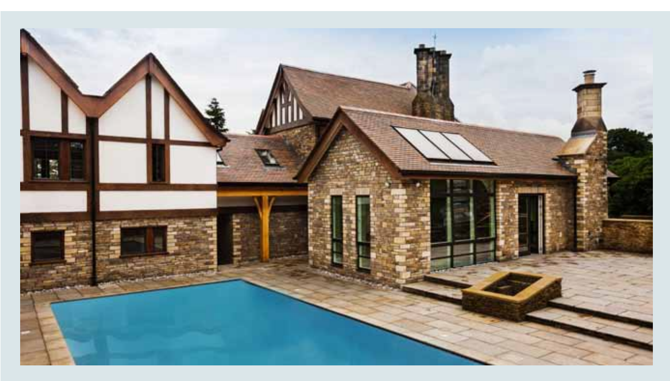
A Type A linked Conservation Rooflight® featuring three casements each with no glazing bar matches the vertical fenestration.

This residential property was built in 1926 in an arts and crafts style and it has recently been extended to a very high standard.